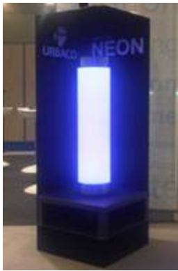
Fixed and Automatic Bollards (Security)